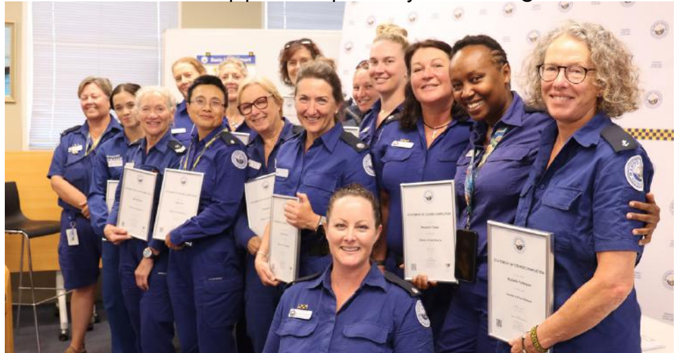
Volunteers from ten Marine Rescue NSW units (Point Danger, Brunswick, Nambucca, Tuggerah Lakes, Broken Bay, Port Jackson, Botany Port Hacking, Narooma, Bermagui, and Merimbula) took part in the Women in Flood Rescue course.

The three-day Marine Rescue NSW Women in Flood Rescue course was supported through a $25,000 NAB Foundation Community Grant.