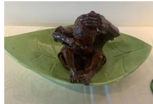
Slave Chocolate by Ruth Halverson.

The exhibition is entirely self-funded by the Artists for the Earth Eurobodalla and is at the Bay Pavilions until the 31st March .