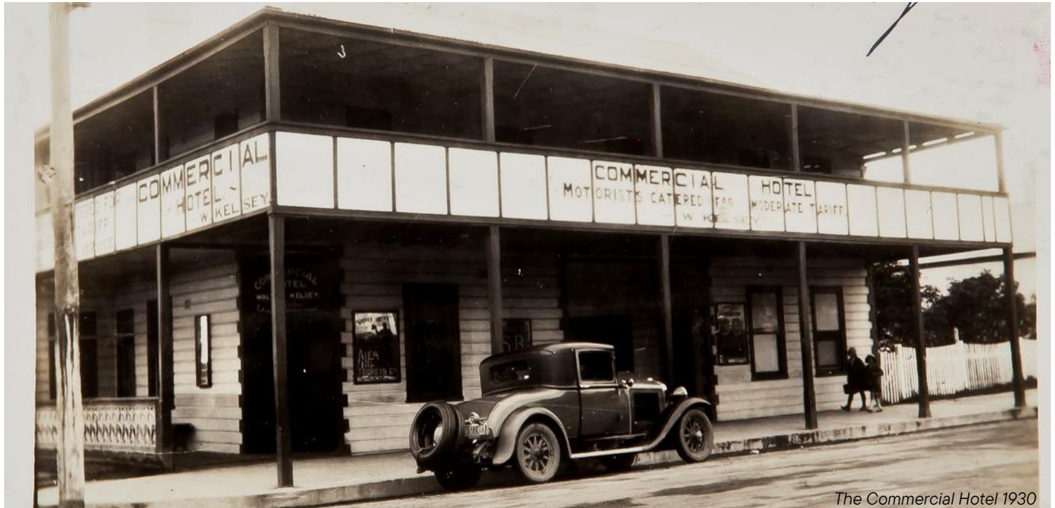
The Commercial Hotel 1930