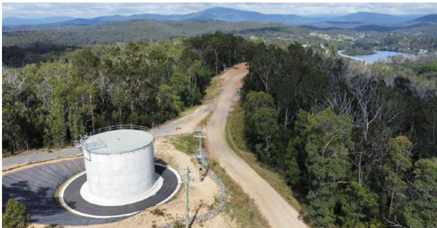
A new water supply reservoir on Clyde Road, North Batemans Bay. From here, water is gravity fed to another new reservoir on Old Nelligen Road.