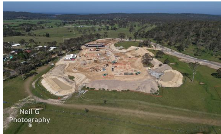
of the Moruya Hospital construction.