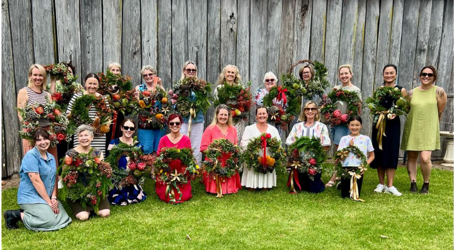
PHOTO OF THE WEEK: Mogendoura Farm Christmas Wreath Workshop with The Wild Rose Florist Moruya captured by Emma Lipscombe.