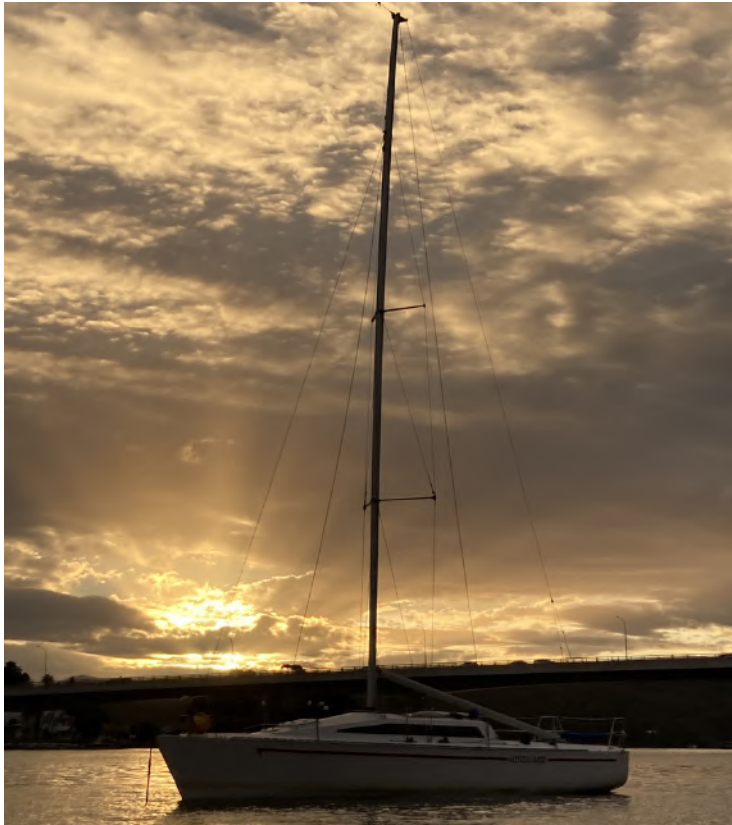
Adams 10.6 "Accolade".

"It was a great day for sailing last Saturday when Batemans Bay Sailing Club conducted the Durras Race, which was the first coastal race completed this season.