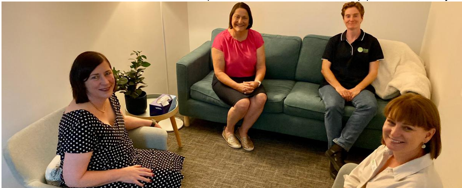
Federal Member for Gilmore Fiona Phillips took a tour of the new Moruya Medicare Mental Health Centre with staff.

The Eurobodalla community now has access to free, walk-in mental health care and support at the new Moruya Medicare Mental Health Centre.