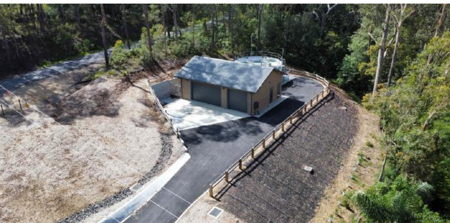
Nelligen's new sewage pump station.