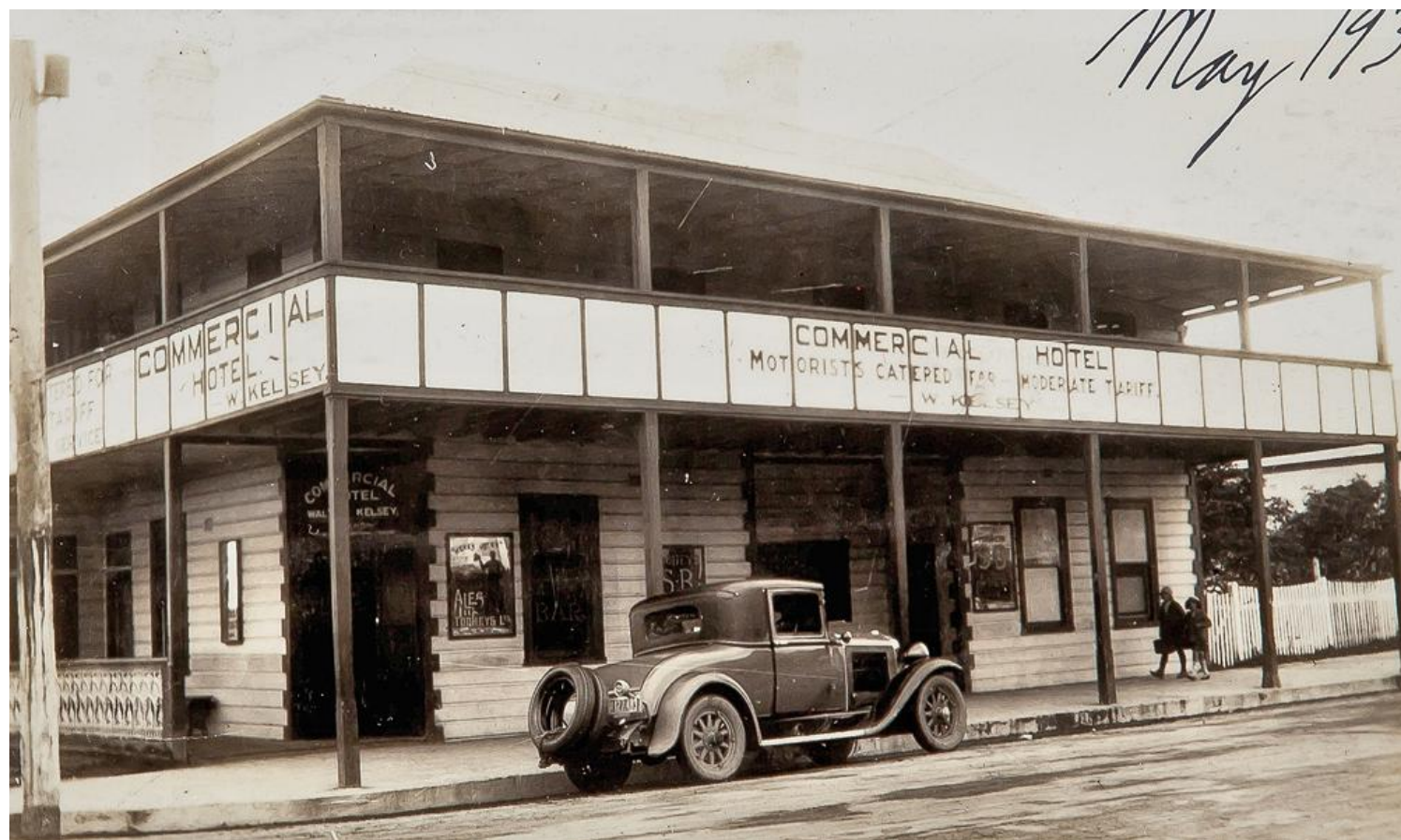
Commercial Hotel 1924 (Tooth Yellow Cards)