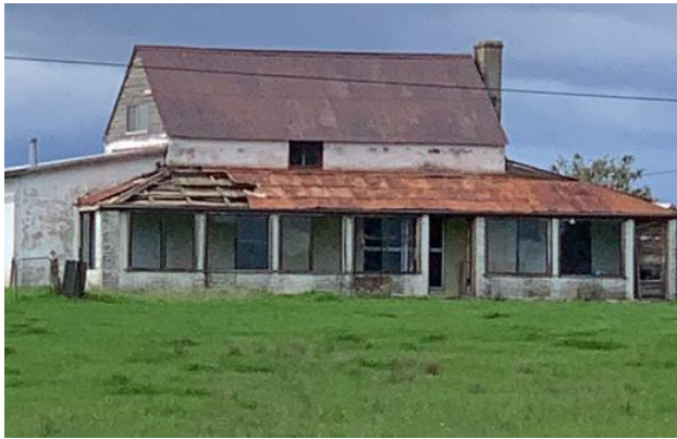
Preparing for a new lease of life: Shannon View on Larrys Mountain Road.