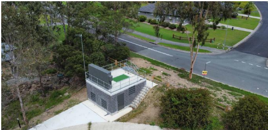
A booster pump station on Bay Ridge Drive boosts the water flow on its way to a reservoir on Clyde Road, North Batemans Bay.

Water is flowing to Nelligen residents for the first time today, after Eurobodalla Council connected the village to the shire's drinking water and sewerage systems.