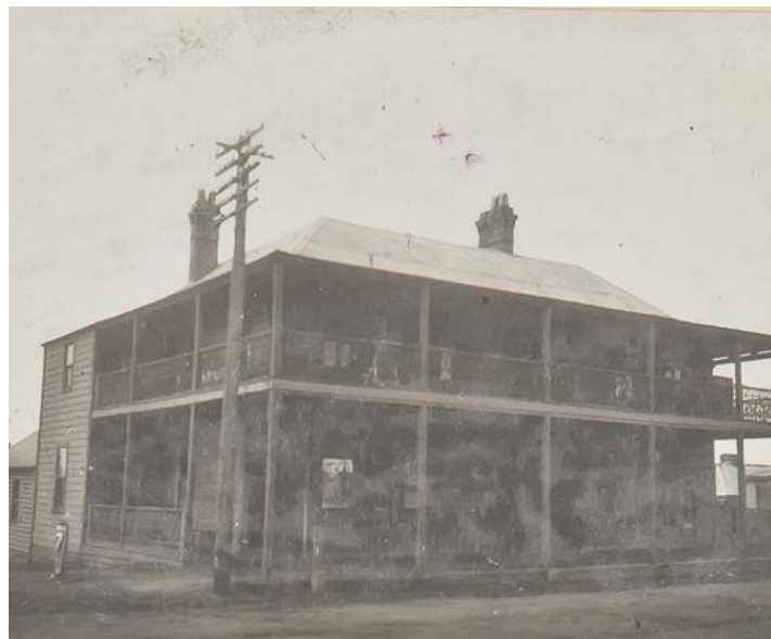
Commercial Hotel 1930 (Tooths Yellow cards)

The launch ran aground when nearing Nelligen, and the party had to be transhipped to another launch. A two innings match was finished in the dusk, the Bay winning by 7 runs.