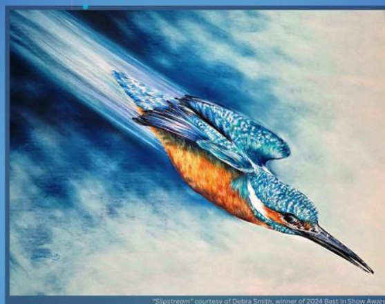
"Slipstream" courtesy of Debra Smith, winner of 2024 Best In Show Award

January 4 - 20, 2025 Open Daily 10am - 4pm Batemans Bay High School